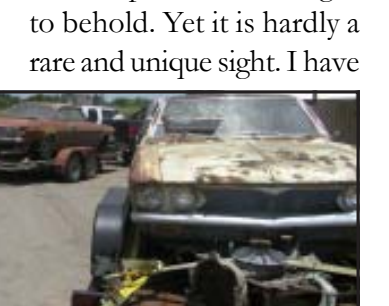
Treasures found, loaded and ready to go...

To witness a Corvair start some 30 years after it last saw pavement is a sight to behold. Yet it is hardly a rare and unique sight. I have