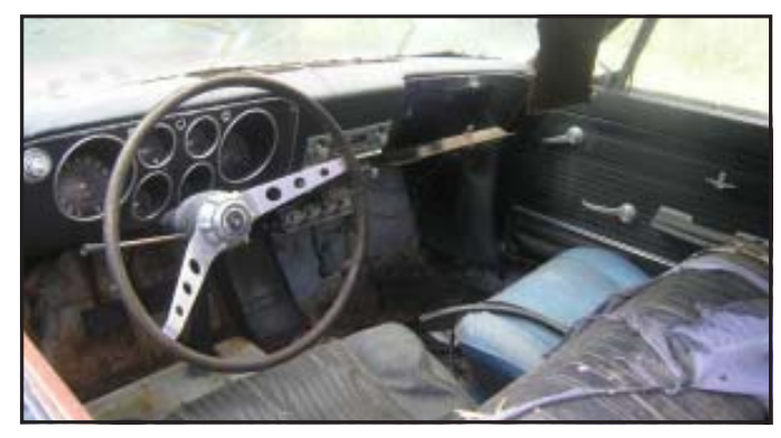
Treasure found...telescopic steering column

Our Corvair rescue league is an adventurous bunch for sure. They see