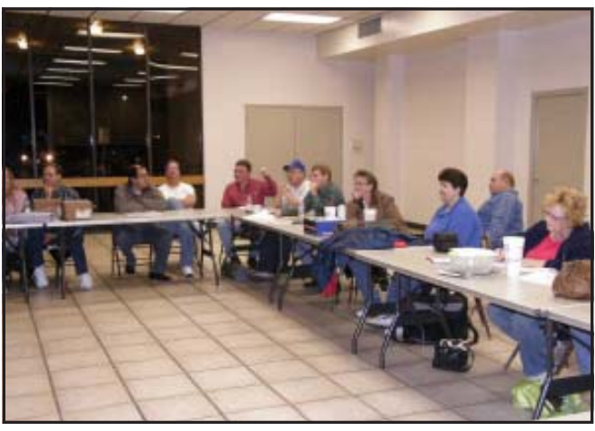
Club meeting on January 16th...Election Night!